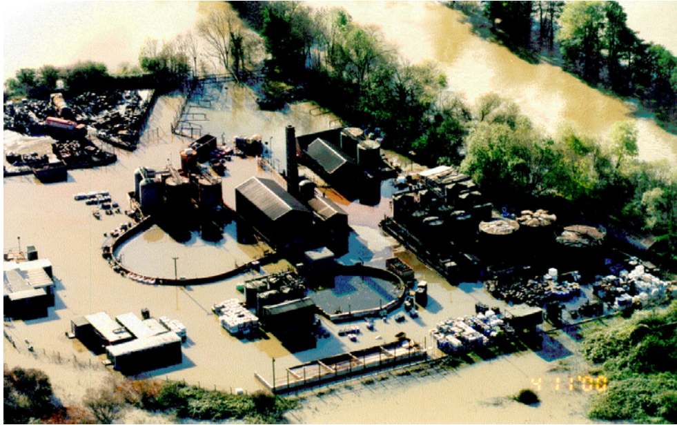
Figure 2. CSG, Ltd., waste storage & treatment facility, Gloucester. November 2000.