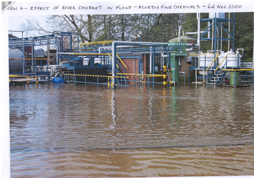
Figure 3. Tessenlerlo Fine Chemicals, Leek, Staffordshire. November 2000.