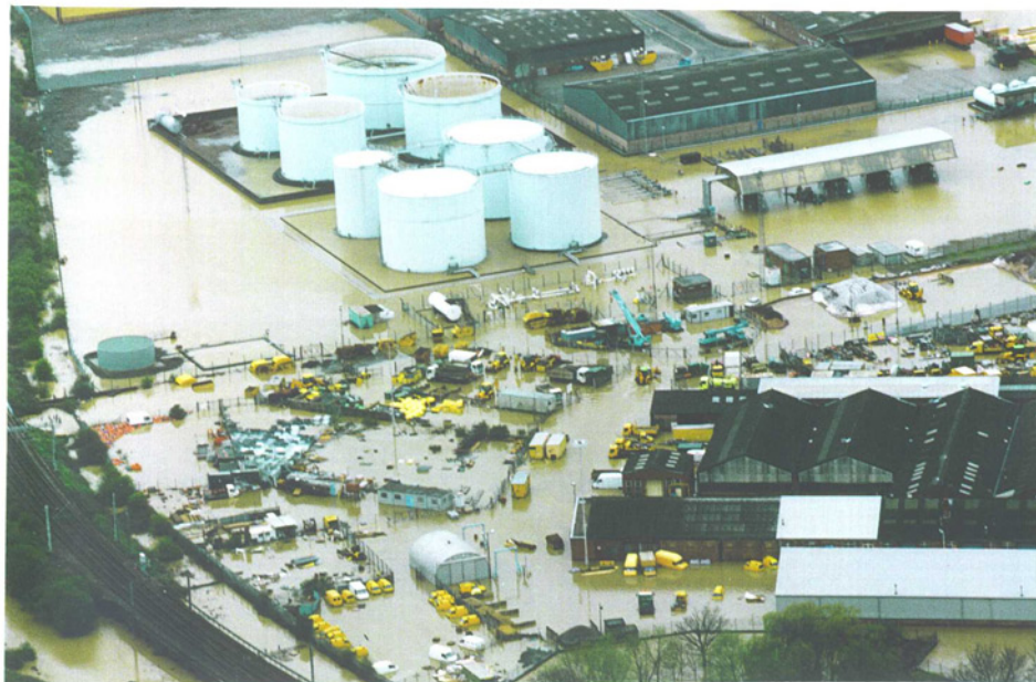
Figure 1. BP Oil (UK) Ltd., Northampton terminal. Easter 1998.