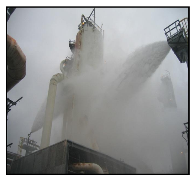
Figure 7. Aim and Shoot Water Mitigation System in Operation

As the name implies, the aim and shoot method of water mitigation adopts the approach of direct application at the point of release. Typically, two, three or four water monitors with a cone shaped spray pattern are directed at the release point. Although this approach is effective in knocking out the HF it requires the water to be accurately applied. The monitors used for this duty can be fixed, remotely operated, manually operated or a combination of the three. Fixed monitors are usually pre-aimed at likely sources of release, remotely operated monitors often with a 'home' position based on likely release point, and manually operated monitors are usually located on the edge of the unit. Figure 7 shows an aim and shoot system utilising remotely operated monitors in operation.