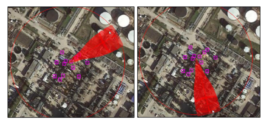
Figure 3. Examples of Good (left) and Zero (right) Detector Coverage

The existing detection system was reviewed to determine the location, operation and reliability of the detectors and whether they were used for alarm only, alarm and activation, or alarm and activation based on voting. Many units have a combination of HF and hydrocarbon detectors. The composition of the material released dictated whether additional credit could be taken for the hydrocarbon alarms. The data was added to the 3D model and a consequence based analysis performed to determine if the scenario would be detected and by how many detectors. For illustration purposes, Figures 3 and 4 shows a series of snapshots from an output for the plume generated by one specific scenario. Figure 3 illustrates directions where good coverage is achieved and no coverage is achieved.