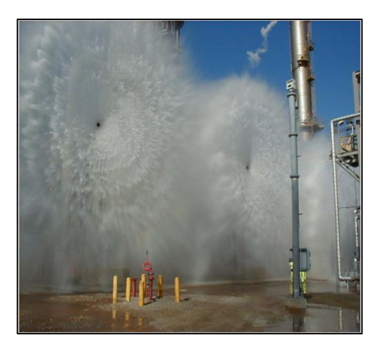
Figure 5. Water Wall Mitigation in Operation

This method utilises the disperse and contact approach and involves an array of monitors with hydraulically balanced water nozzles set to produce a fog which create a wall of water, as shown in Figure 5. This type of system is often located along the perimeter of the HF Alkylation unit to achieve the spacing required for effective absorption and to maximise the scenarios it can effectively mitigate. Activation of the water wall can be automated, normally based on a voting logic involving multiple detectors, or manually initiated once a release has been confirmed.