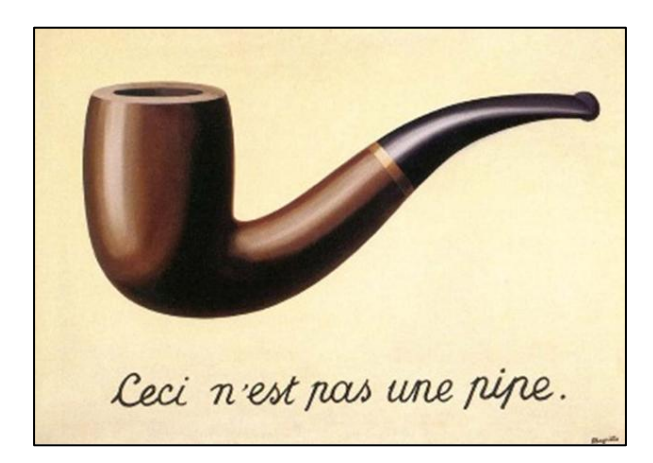
Figure 1. "The Treachery of Images" by René Magritte

The value of the data generated by a QRA is reliant on the quality of the input data, the accuracy of any models utilised in the analysis, and the robustness of the assumptions made. The often quoted statement by 20th century statistician George Box "essentially, all models are wrong, but some are useful", is particularly pertinent when applied to QRAs. Another useful analogy comes from Belgian surrealist painter René Magritte, and his painting "The Treachery of Images", shown below.