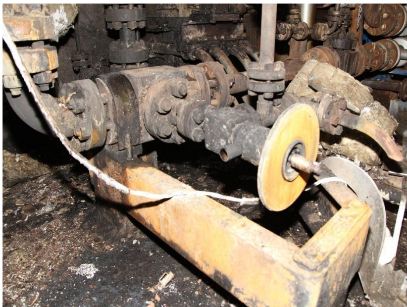
Picture 1: Relief valve missing the actuator and showing the short stub of the tell-tale vent point

The plant management found that the flame had emanated from a tell-tale vent on one of the thermal expansion valves located on the ground floor of the reactor area. In addition the electro-magnetic actuator of this valve had been displaced and the electrical connections broken. The flame damage indicated that some structural steelwork had been exposed to a high temperature typical of a jet flame. Electrical equipment on peripheral equipment had been damaged to a height of 3 floors above the ground floor.