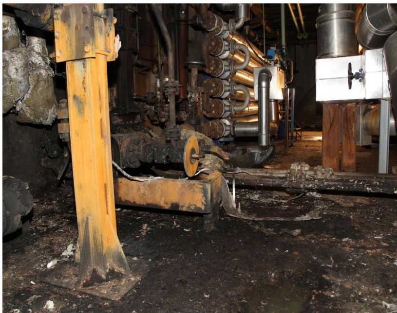
Picture 2: Structural steel work showing effects of extreme heat after exposure to the jet flame