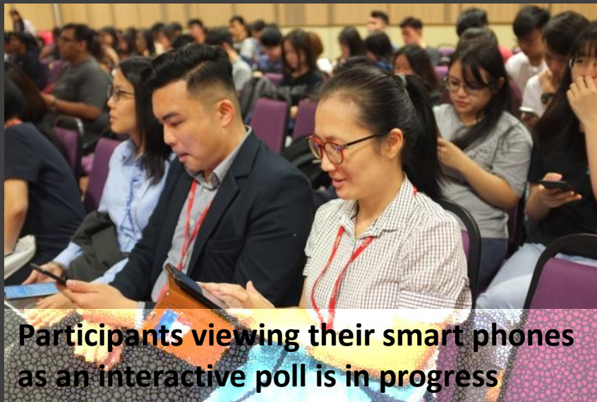
Participants viewing their smart phones as an interactive poll is in progress