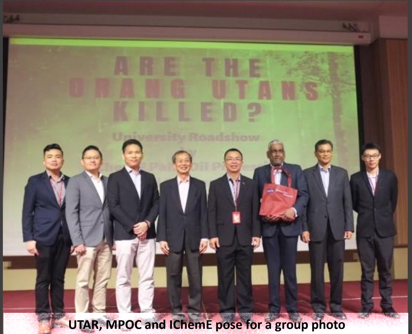
UTAR, MPOC and IChemE pose for a group photo