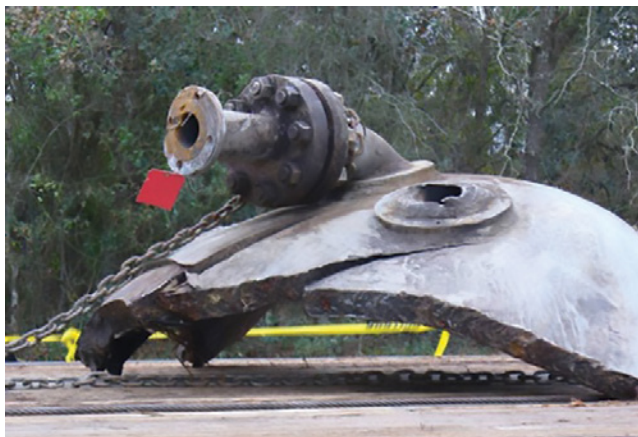
Figure 1 – Section of the MCMT reactor post-explosion

vent pipe conjoined to a primary 100 mm vent pipe with a rupture disk set to 400 psi (27 barg), shown in Figure 2. In an over-pressure event, the PRV should have been able to control the excess pressure by venting hydrogen, mitigating any imminent hazards 5 . However, the PRV failed and was designed without acknowledgement of the possibility of a secondary exothermic reaction. This was in part due to the limited knowledge of the MCMT reaction. Regardless, venting is unlikely to be the pivotal issue. Whilst the thermokinetics of the reaction were not fully established, damage suggests it might well be that the required vent-size for a full-scale runaway is larger than the top of the reactor. Even if the vent operated to specification, the material would still be highly flammable and continue reacting. Therefore, discharge to the environment into secondary containment would also be unsuitable as discussed in other studies 5 . In this study, PI (process intensification) for the purposes of dramatically improving process safety becomes an interesting and suitable proposition — specifically the use of spinning disc reactors.