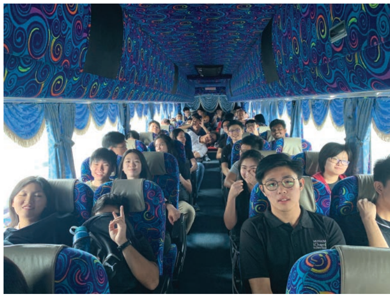
Departure for Sime Darby Palm Oil Plantation