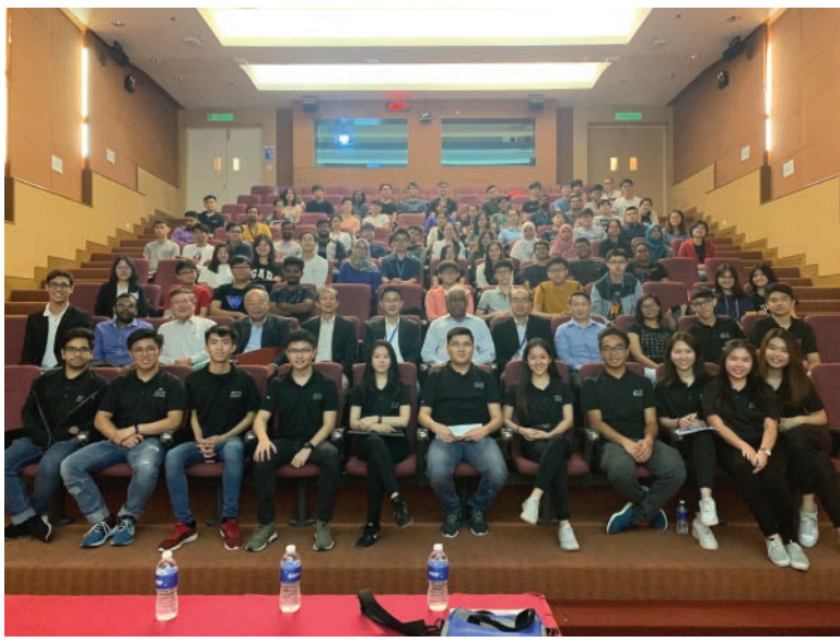
Group photo session