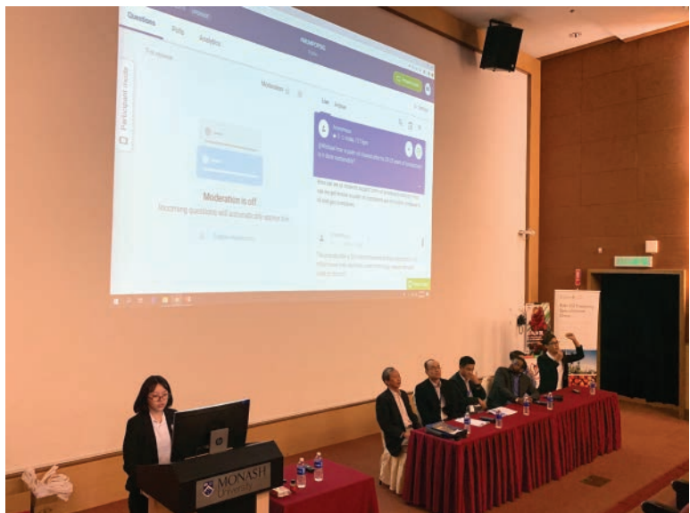
Q&A Session through online platform