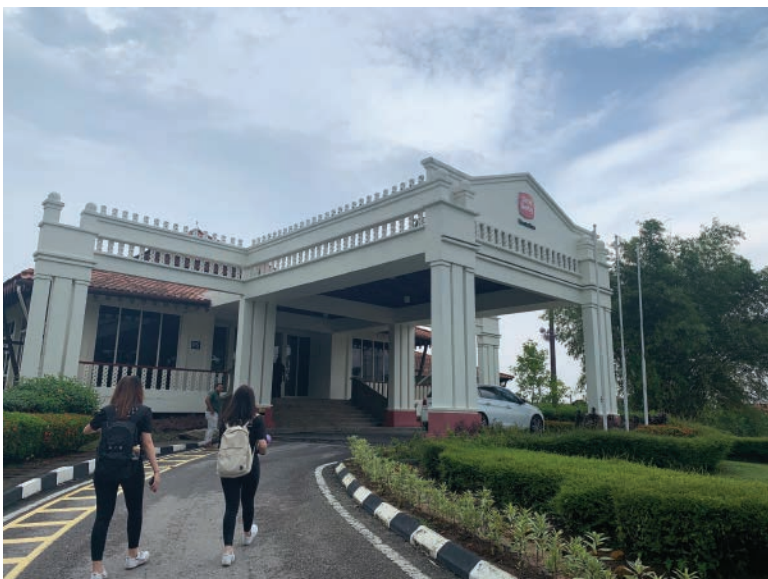
The site visit continues to the Sime Darby Palm Oil Experience Center