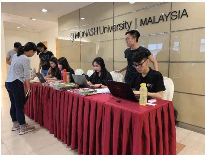
Participants registering for POPSIG University Roadshow 2019-2020 at Monash University

* Lunch is only provided to the students who are visiting the plant.