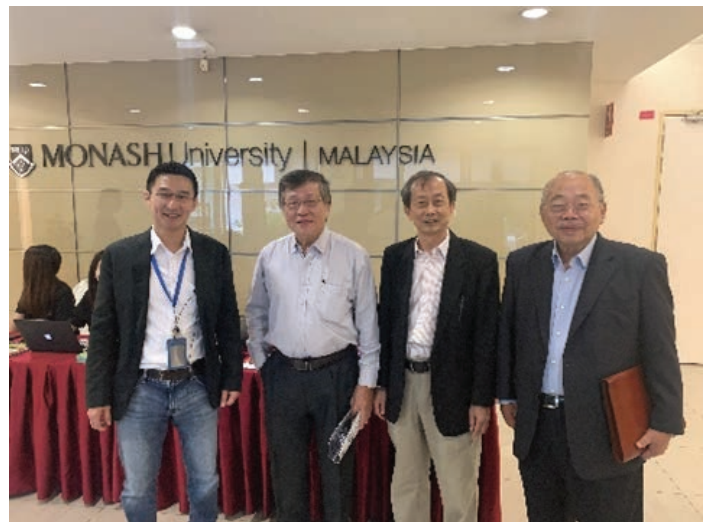
Distinguished guests for the University Roadshow