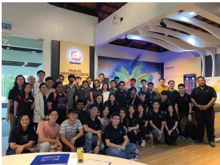
The program ends with a group photo session