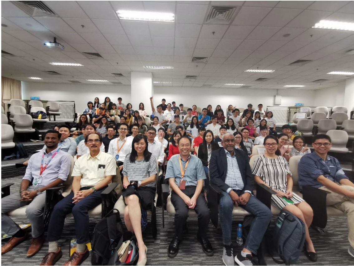
A group photo with all speakers and participants