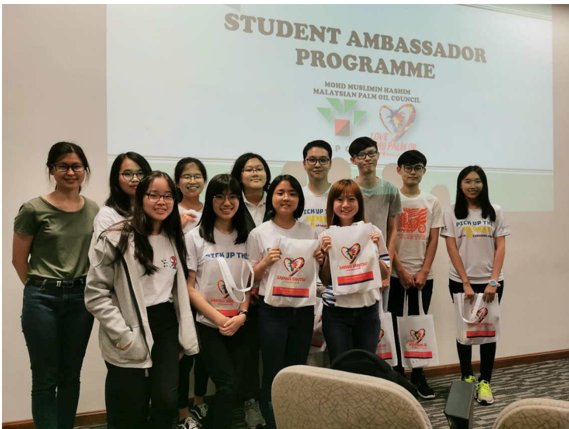
Volunteers for the Student Ambassador Programme