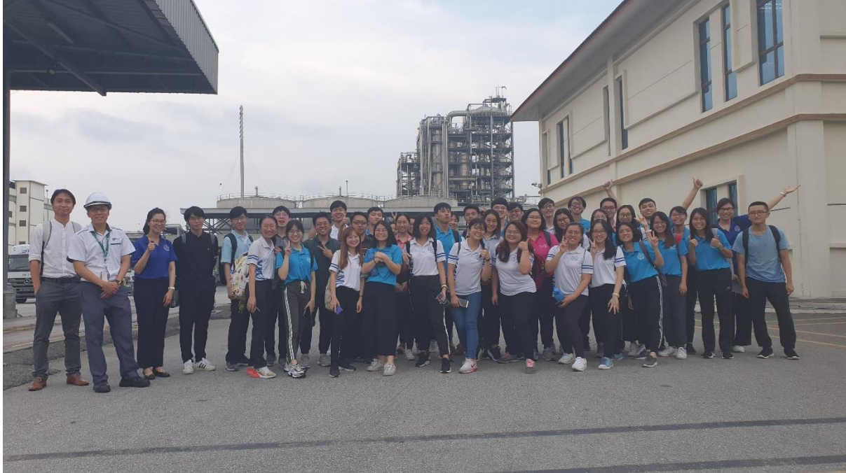
A group photo at KLK-Kepong Oleomas Sdn. Bhd.