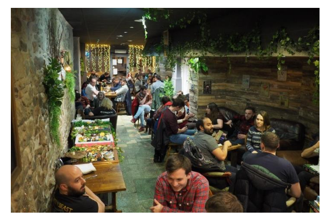
Excellent turnout at our Inter-institute guiz in December