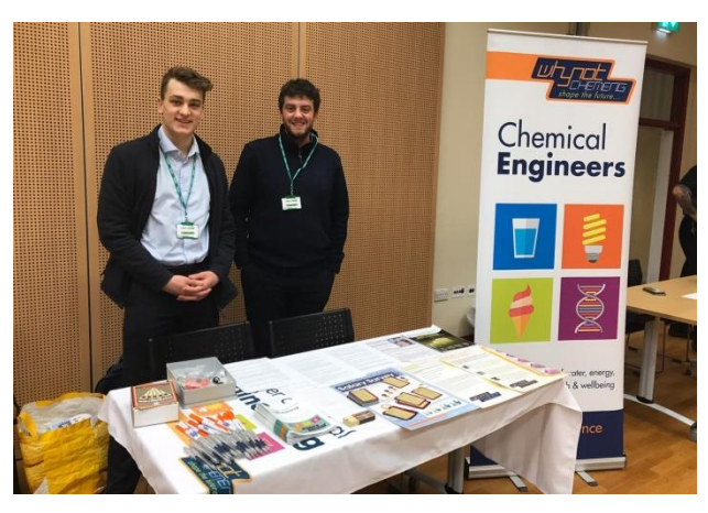
Two of our members promote IChemE and whynotchemeng at a local careers fair

The vision of the CLEP is to promote Cumbria as the place to live, work, visit and invest sustainably where exceptional industry and innovations meets a breathtakingly beautiful productive landscape. A place marketing campaign is currently being deployed to encourage people to move to/work in Cumbria.