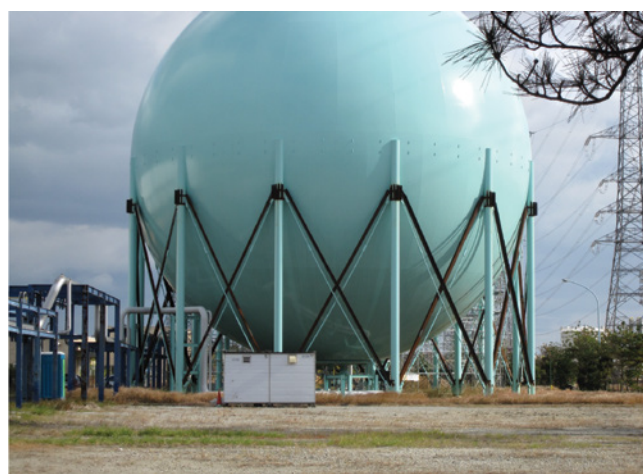
Figure 5 – Strengthening of tank supports in the Sendai coastal area

In Japan, chemical accident risk management is regulated by many different laws and regulations. At the time of the GEJET, only Japan's High Pressure Gas Safety Law explicitly addressed Natech risks due to earthquake and tsunami, requiring measures to be taken to reduce the associated accident risk 16 .