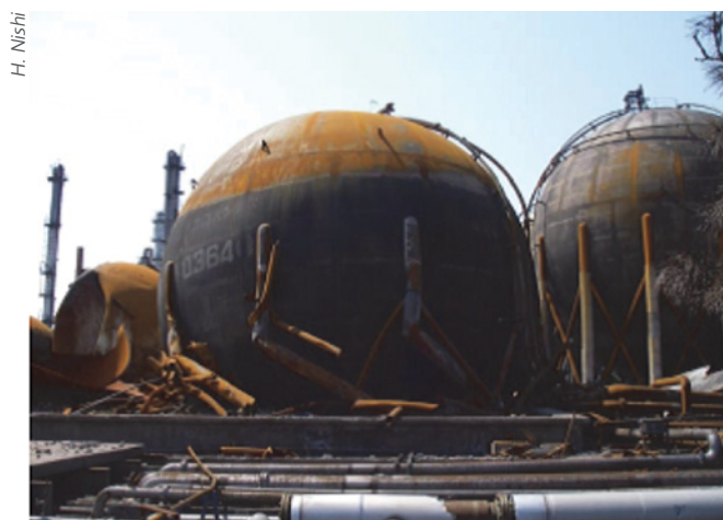
Figure 2 – Buckling of tank legs due to earthquake

Another Natech accident whose pictures went around the world was the multiple tsunami-triggered fires at a refinery in the Sendai port area. The inundation depth at the site ranged from 2.5 to 3.5 m, killing four people and causing multiple loss of containment