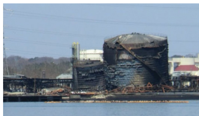
Figure 3 – Burned and melted tanks at a refinery in Sendai port due to tsunami

With an LNG tank from a different operator located immediately to the south of the burning refinery section and tsunami-triggered flammable releases in another industrial site south to the LNG tank, there was also a high risk of a domino effect. Emergency responders had to take great care to keep the releases from igniting to avoid heat impingement on the LNG tank from two sides which it might not have withstood without damage.