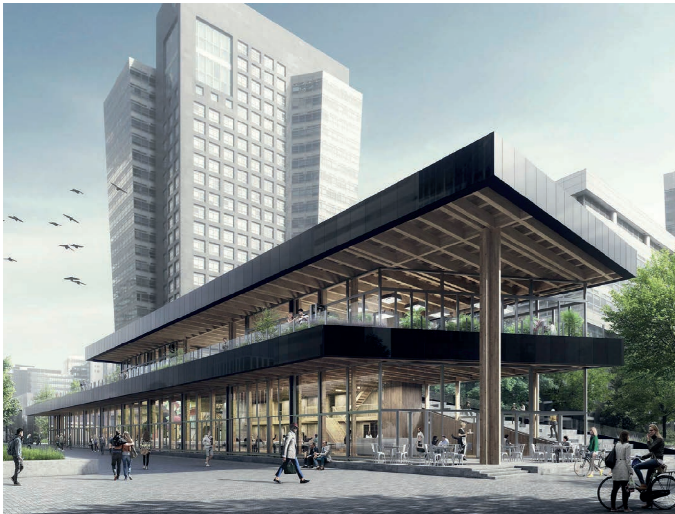
Exterior of Circl ABN AMRO's sustainable pavilion.

Important aspects of waste reduction and circularity in the built environment including the extension of