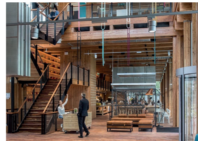
Interior of Circl ABN AMRO's sustainable pavilion.

Concerns about the legal and insurance ramifications of such changes are common in the sector. Insurers have tended to be conservative in the past, relying on risk history, and therefore struggle to price risks associated with forward-looking innovative approaches, inhibiting innovation in the sector. There is a need to learn from those who have overcome contractual barriers and dealt with liability issues successfully. The rapid rise of future scenario planning and climate related financial disclosures is likely to have a significant impact by ensuring that climate risks are referenced in investment decisions. This opens new funding opportunities linked to improved resilience, working with the insurance industry and mobilising resilience bonds. The consideration of this type of risk will help drive forward the decarbonisation of construction, as long as a systems approach is taken