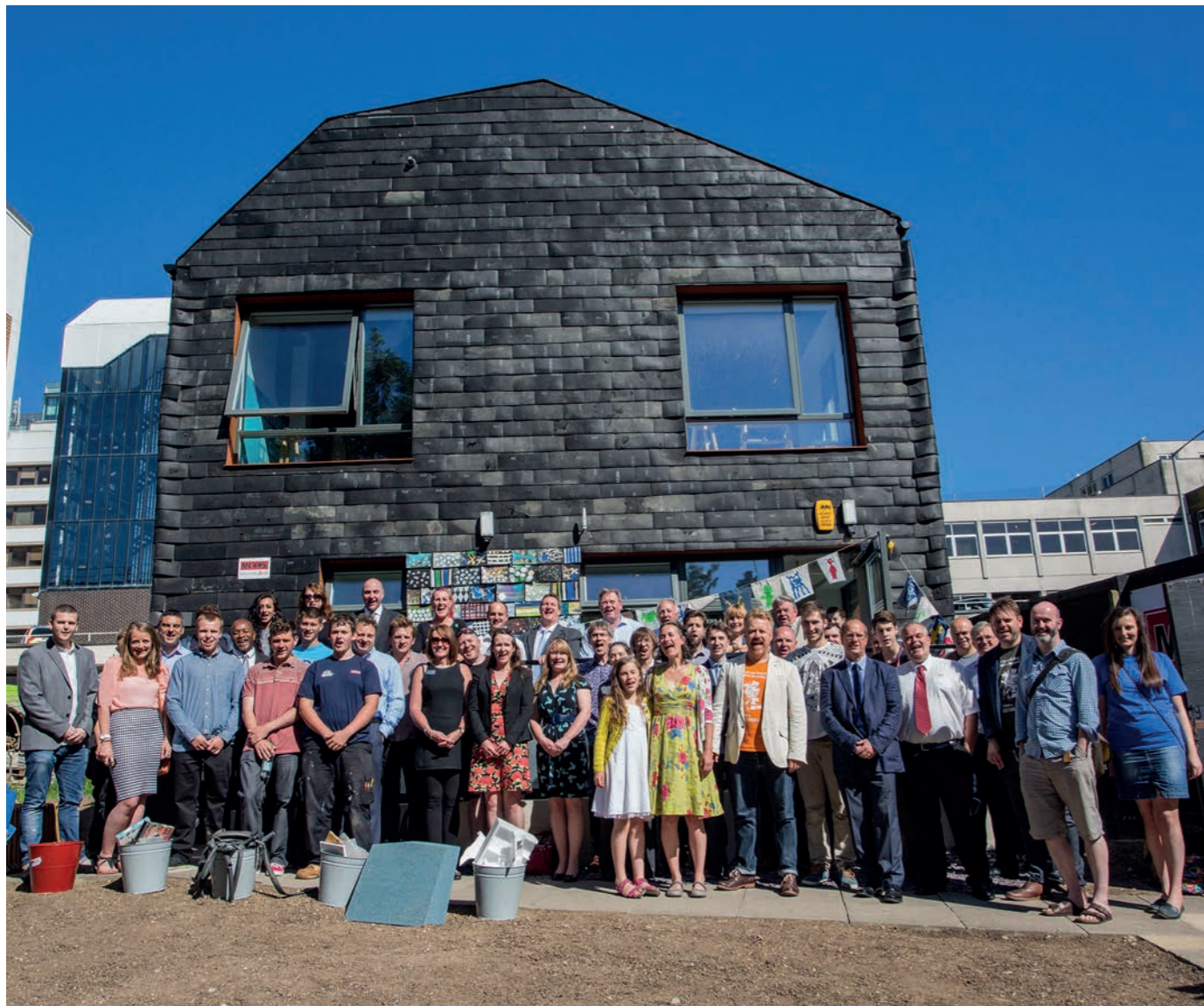
Exterior of Brighton Waste House.

There may be ways of introducing improvements without creating additional risks; for example, using existing materials more efficiently. Testing is one way to mitigate risk and to allow low carbon products to be marketable. Government support, backed by the certification process proposed previously in this report (see page 15), for development and testing of low-carbon materials would increase interest from manufacturers and drive the market for low-carbon building products, increasing their speed of development and availability.