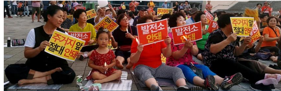
South Koreans Protest Gangneung Storage Tank Explosion