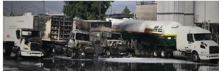
Air Products Santa Clara Valley – Supply Disruption