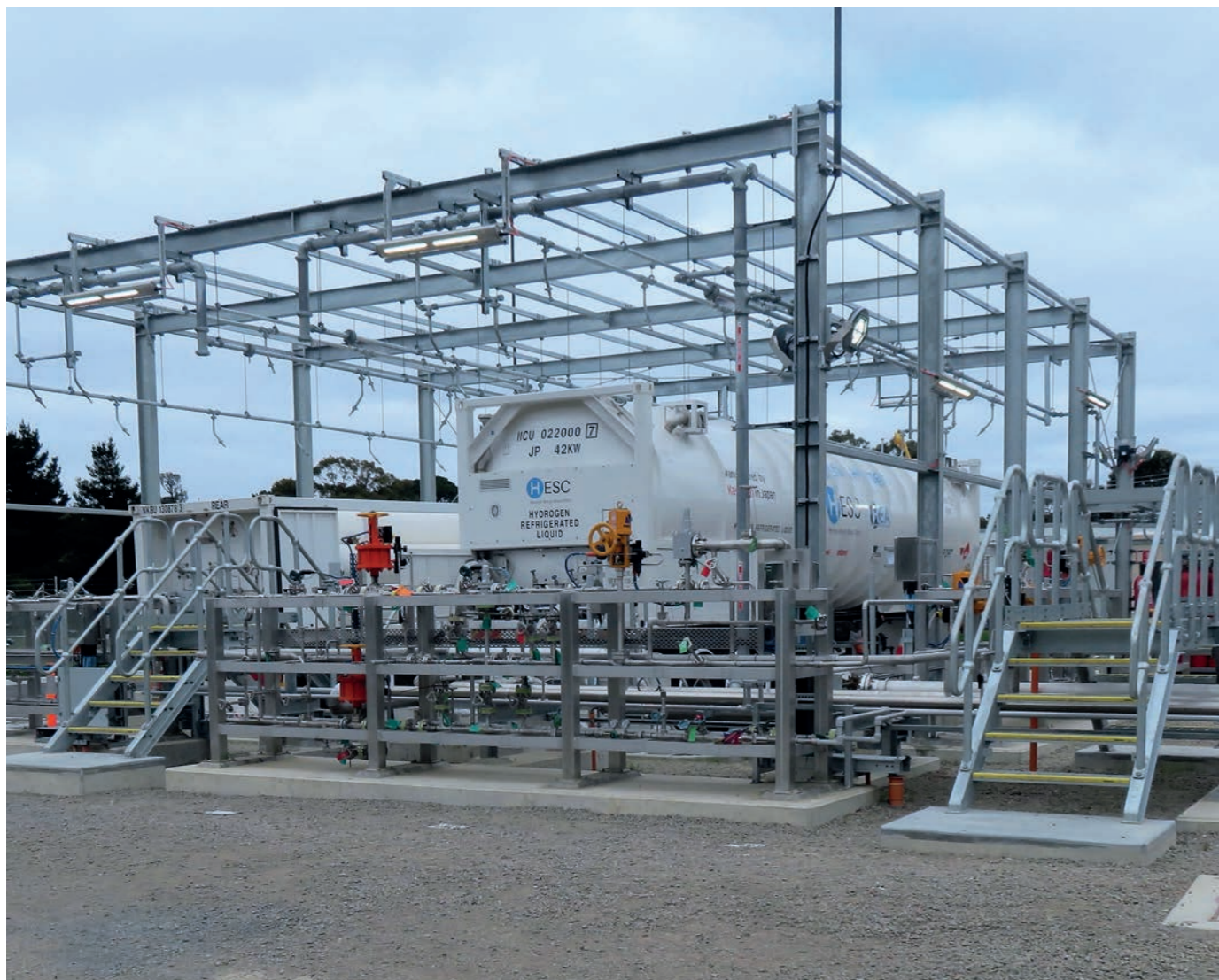
Pilot scale hydrogen production project in Hastings, Victoria, Australia

This means including these sectors in the pilot projects aimed at scaling up hydrogen production, storage and end-uses, and increasing the products, markets, skills and knowledge base needed to do so. Pilot projects and any further roll out of hydrogen technologies should be partnered with public engagement aimed at developing people's understanding of this new energy vector and its use in the sectors where it is adopted. This will allow these otherwise hard-to-decarbonise sectors to take advantage of the increasing availability of hydrogen, achieve immediate emission reduction and be a successful part of the net zero transition.