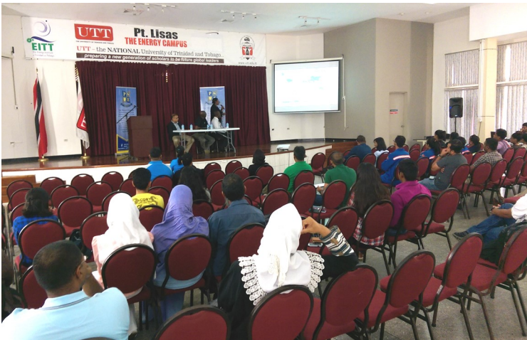
Members of the audience during the seminar, "What Chemical Engineering Trends Mean For You"

The speakers highlighted global trends, threats, key strategies and realities that Chemical Engineers should be aware of. There was discussion on the challenges currently being faced by Chemical Engineers at varying stages of their careers, and how one could "adjust their sails" to withstand these challenges. The seminar was attended by Chemical Engineers from the upstream, midstream, and downstream energy industry, engineering service companies and academia.