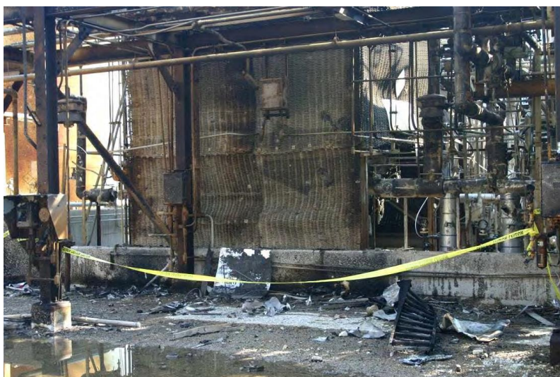
Figure 5 Post-incident view of MIC day tank blast shield at Bayer CropScience plant (CSB, 2011).

Section 2.2 detailed the successful avoidance of a domino effect involving the MIC day tank at a pesticide production facility. Figure 5 gives a post-incident view of the passive barrier (blast shield) that prevented further harm. Had the shield failed, or had missile fragments from the original explosion struck an unprotected part of the day tank, the consequences could have been disastrous. (There is much more that could be related about this incident than space permits here. Readers are referred to CSB, 2011).