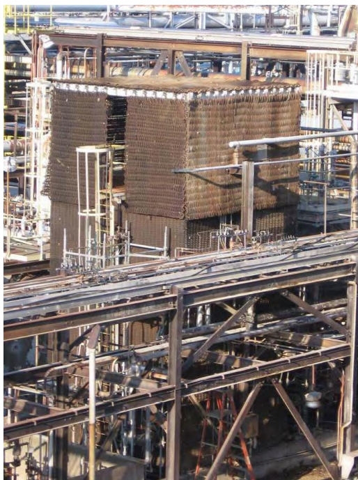
Figure 2 MIC day tank blast shield structure at Bayer CropScience plant (CSB, 2011).