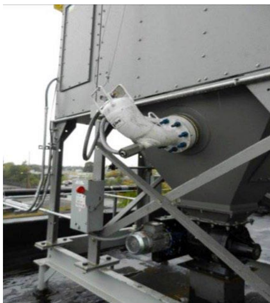
Figure 3 Dust collector at US Ink facility, with explosion suppression canister in centre foreground (CSB, 2015).