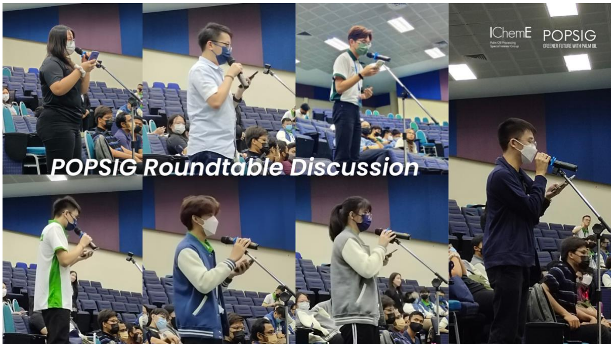
Figure 4: The students expressed their views and suggestions to the panel about the latest development in the palm oil industry.