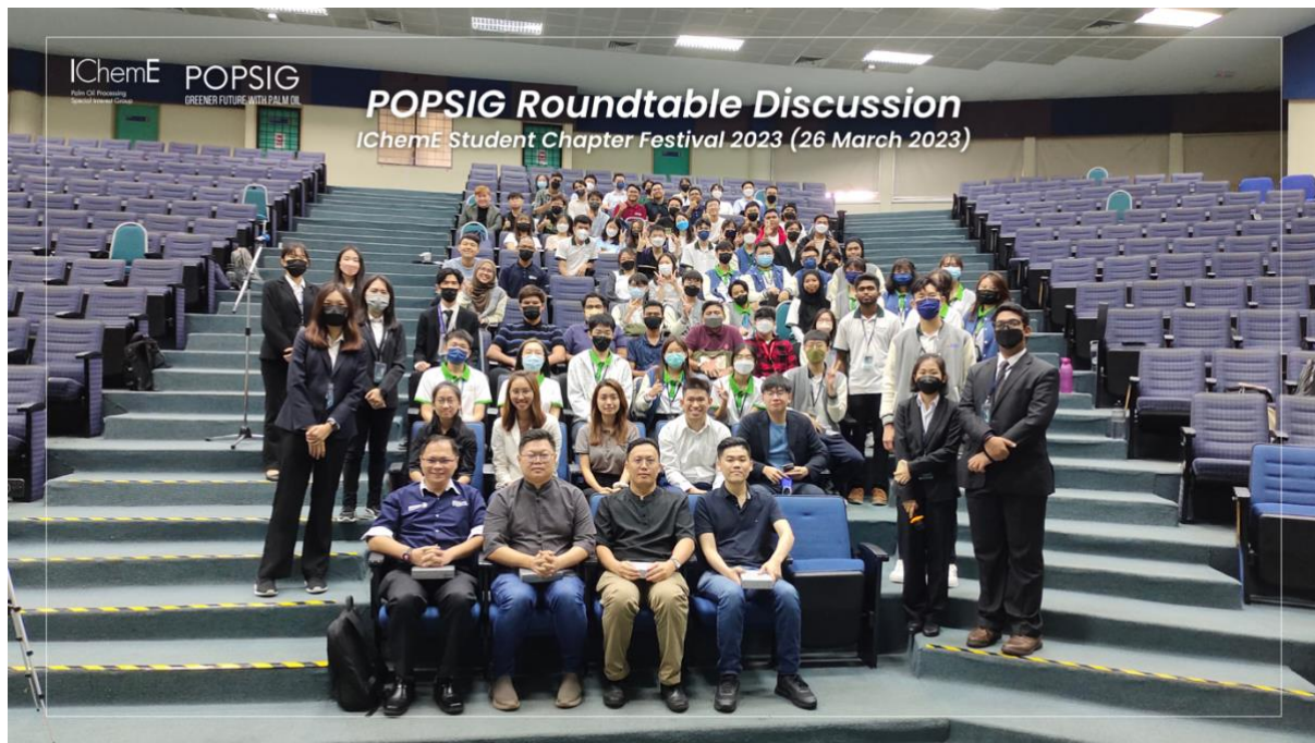
Figure 2: Group photo session in Universiti Malaya.