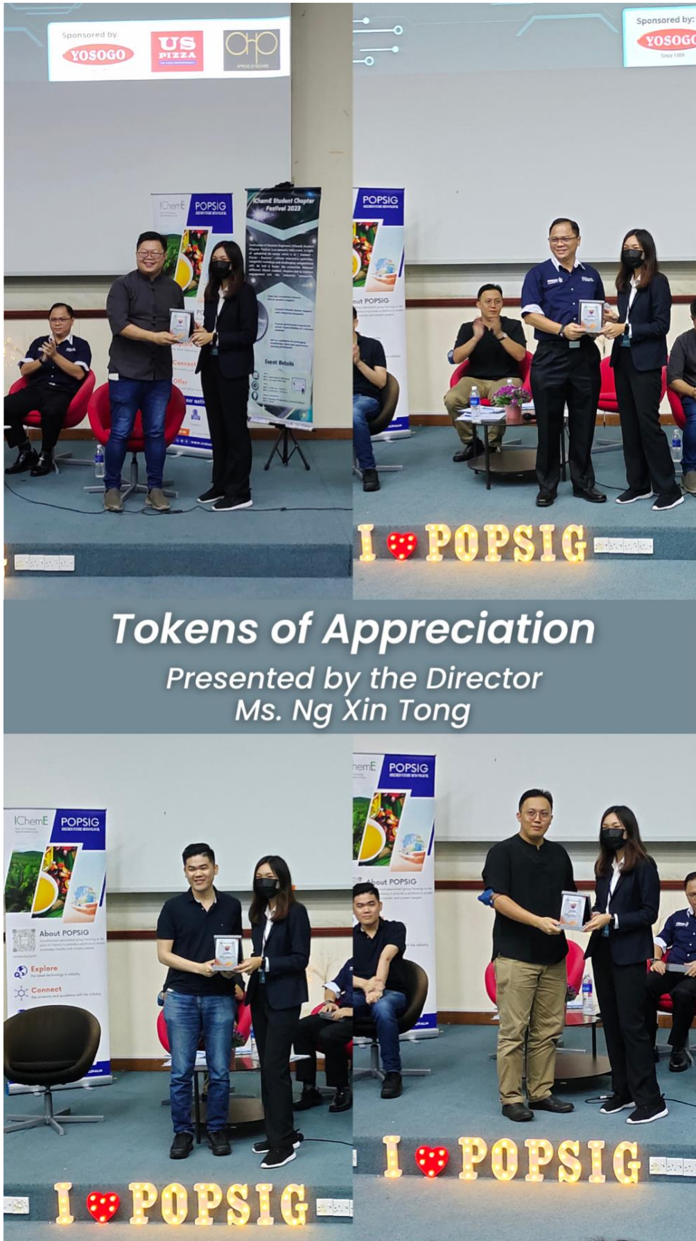
Figure 5: The tokens of appreciation were presented by Ms Ng Xin Tong to the panellists.