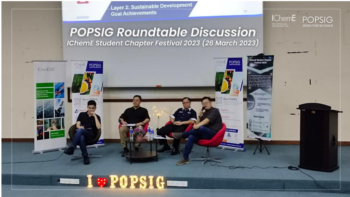
Figure 3: The panel exchanged views with the students.