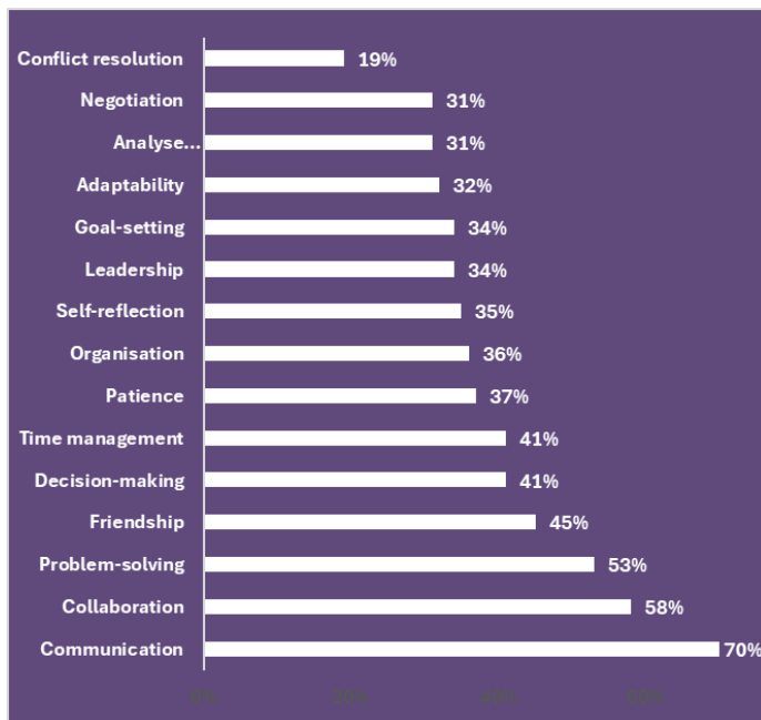
Figure 2. Student perceived improved skills after participating

In traditional courses often dominated by individual assignments and technical assessments, opportunities for interpersonal development can be limited. Yet, these are precisely the skills that employers now seek and that students, especially international ones, often find challenging due to linguistic and cultural differences. Moreover, game-based learning, when implemented thoughtfully, offers an efficient method to bridge that gap. It provides