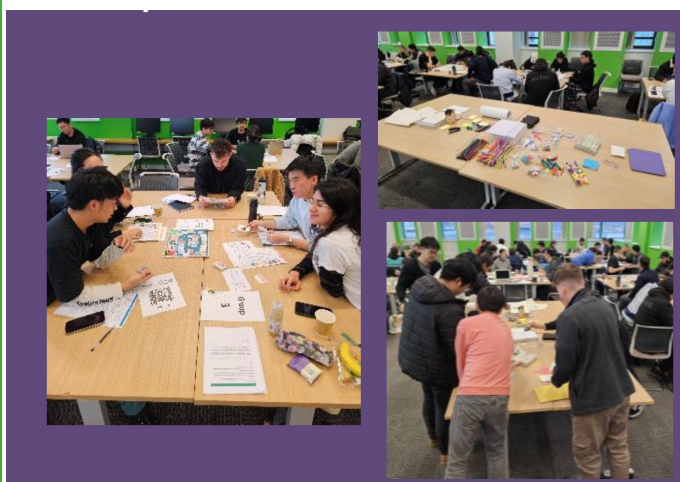
Figure 1. Students participating in the game-based workshops

In alignment with this vision, we presented our recent work on designing and implementing a game-based workshop aimed at enhancing team collaboration skills among postgraduate taught (PGT) students in engineering programmes. The workshops were delivered at two Russell Group institutions — the University of Sheffield and the University of Manchester — and involved a total of 145 students from chemical and electrical/electronic engineering disciplines. Inspired by game theory and experiential learning principles, the workshop featured a hybrid of board and simulation game elements such as storytelling, visual aids, role-based tasks, and competitive challenges (Figure 1). These elements were used