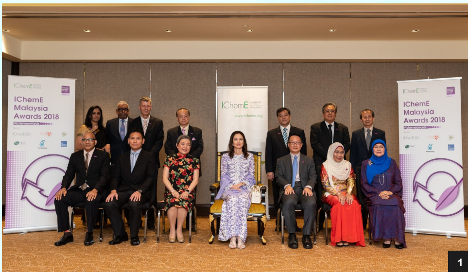
1. IChemE In Malaysia board members with the Queen