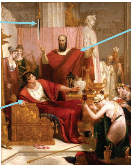
Figure 1. Managers engaged in a safety discussion (The Sword of Damocles, Richard Westall 1812, Ackland Art Museum)