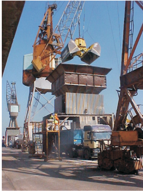
Figure 2. Animal feed and fertilizer off-loading

of DSEAR. This comprised sixteen materials handled at the grain terminal (excluding the bulk storage sheds):