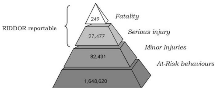
Figure 1. Accident triangle 8

When you consider the number of accidents and incidents that do not fall under the category of a ‘RIDDOR’ reportable ( Fig 1 ) not only is there a wealth of information that